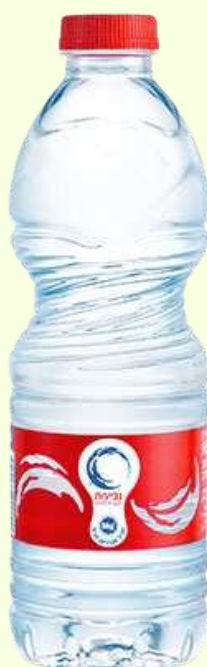
MINIRAL WATER 500 ML