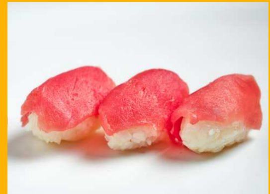
FRESH RED TUNA 32