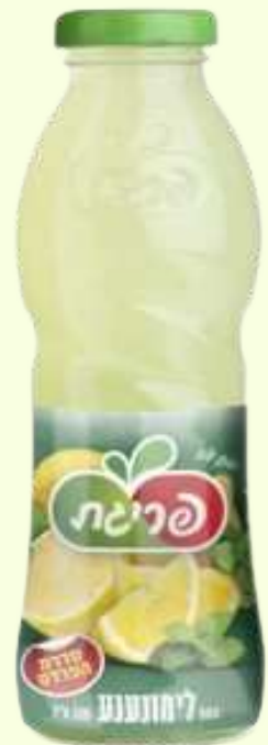
LEMON JUICE 330 ML