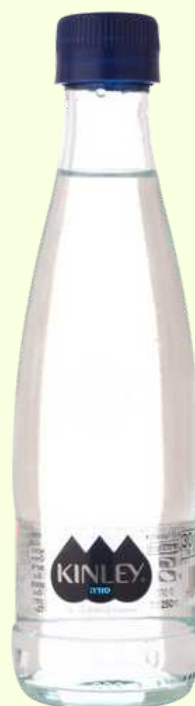
SPARKLING WATER 250 ML