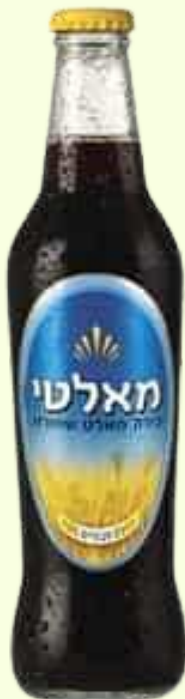
ROOT BEER 330 ML