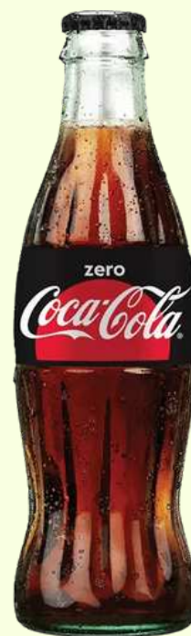
COCA-COLA ZERO 330 ML