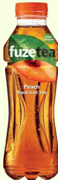
FUZE TEA 330 ML