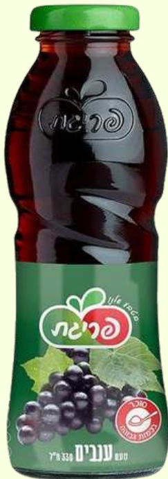
GRAPE JUICE 330 ML