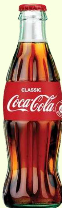
COCA-COLA 330 ML