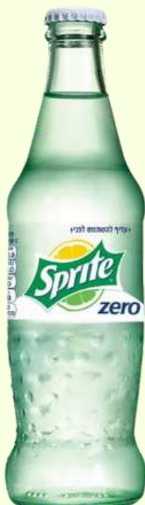
SPRITE ZERO 330 ML