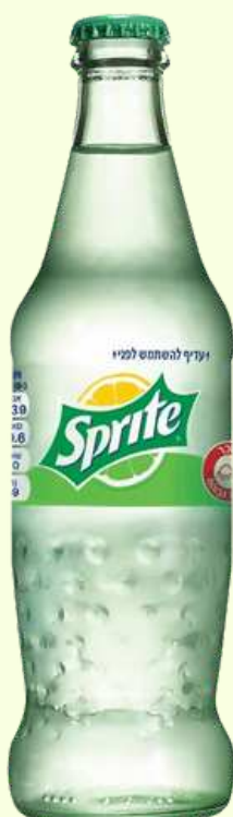
SPRITE 330 ML