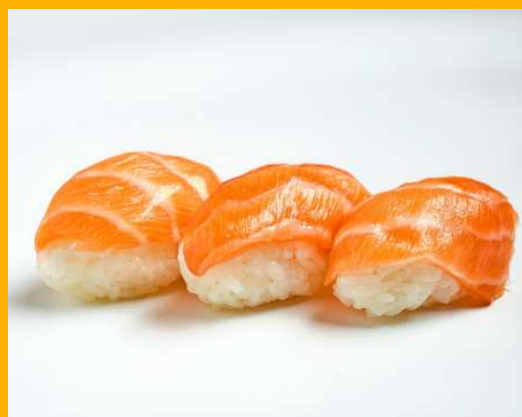
FRESH SALMON 32