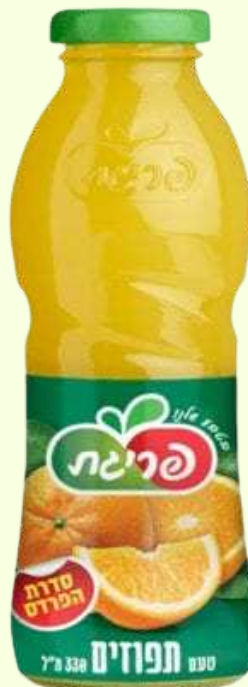
ORANGE JUICE 330 ML